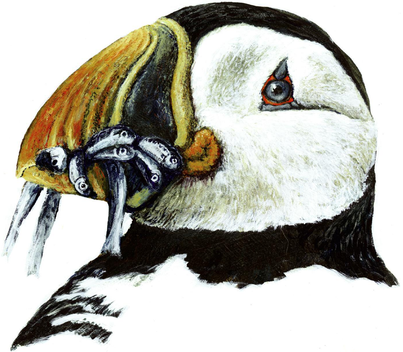
Acrylic on paper. © Ray Nelson.