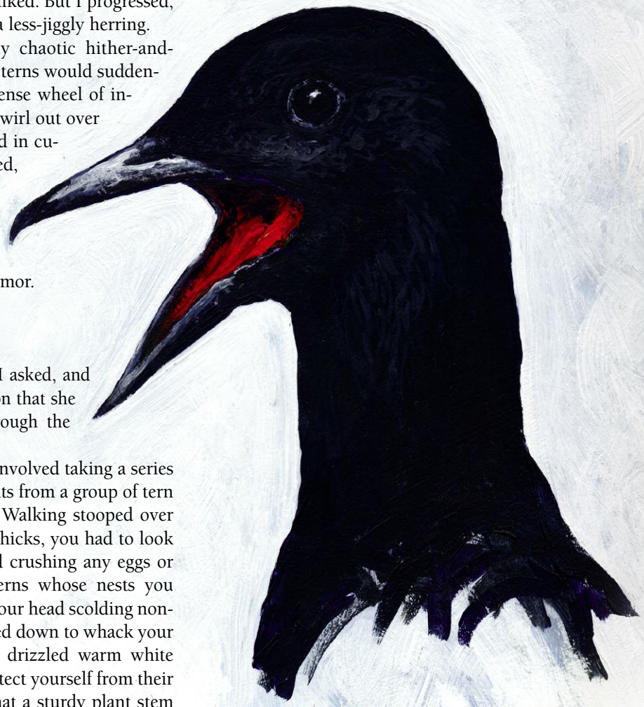
Acrylic on poster board. © Ray Nelson.

Across the soft flanks of the island I was also taught upon arrival to walk most cautiously, to avoid collapsing the burrows of slumbering Leach's Storm-Petrels. Each night, these dainty coaly seabirds crisscrossed the island in tilting flight, casting humps of chuckling song through the watery darkness. From underground they churred—a rising phrase like a question repeated across acres all hours of the island's nights. Stepping from my tent I watched the petrels' shadow-shapes flick in and out of my vision and the pale bridge of the moon's light stretched at us over the black water. I walked, ever careful of the burrows, through what felt like a dream, touching the warmth of my skin and the coolness of the island's pelt to know, yes, this is me, really here.