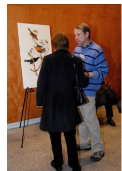
Guests enjoying the Rusty Blackbird print