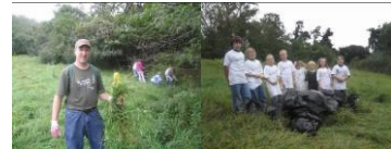
Trumbo Hollow on the Appalachian Trail in the Upper Blue Ridge Mountains IBA

Please join us for an important TogetherGreen event. Volunteers are needed to collect recyclable and non-recyclable manmade materials from forests and marshy shorelines adjacent to Powell Creek. Dog wood trees will be planted along disturbed forest edges to encourage attraction of wildlife.