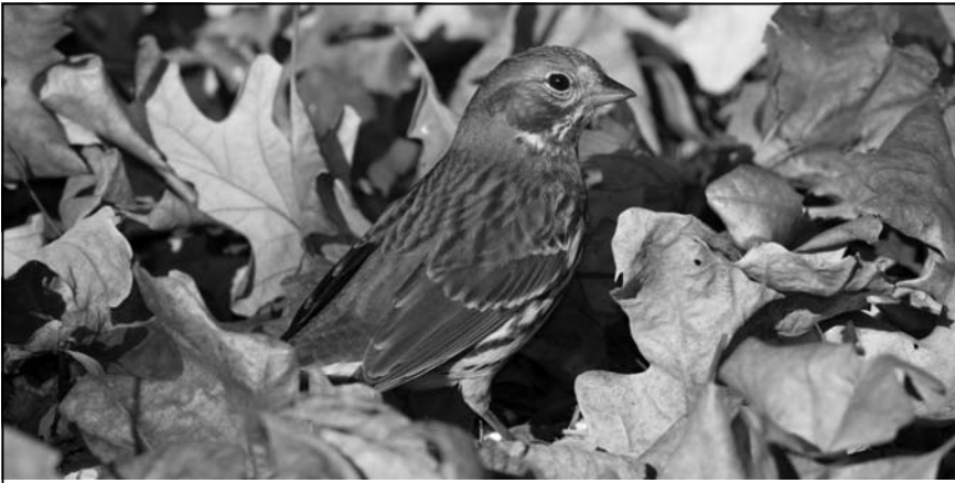
Fox Sparrows ( Passerella iliaca) in general vacate the central and northern portions of the continent for their wintering range in the southeast by the Christmas Bird Count period. However, this lovely bird (left) was one of two Fox Sparrows lingering in the frozen center of the continent at Sioux Falls, South Dakota.