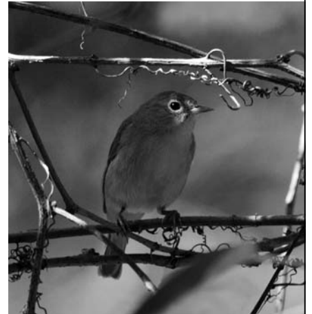
Out-of-range species are the spice of life for CBC participants. Fantastic and varied finds all were this (from left to right) Bullock's Oriole ( Icterus bullockii) far north and east at Lewiston, Pennsylvania ; a Black Vulture ( Coragyps atratus) startlingly far north at Thomaston-Rockland, Maine ; and a Nashville Warbler ( Vermivora ruficapilla) likely on its way to the Caribbean or Latin America at Kendall Area, Florida.