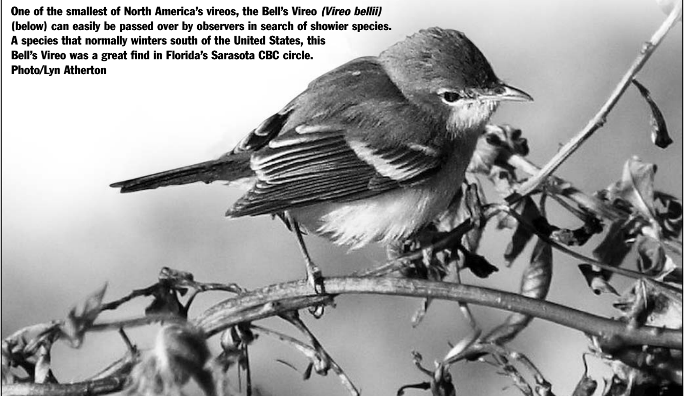
One of the smallest of North America's vireos, the Bell's Vireo ( Vireo bellii ) (below) can easily be passed over by observers in search of showier species. A species that normally winters south of the United States, this Bell's Vireo was a great find in Florida's Sarasota CBC circle.