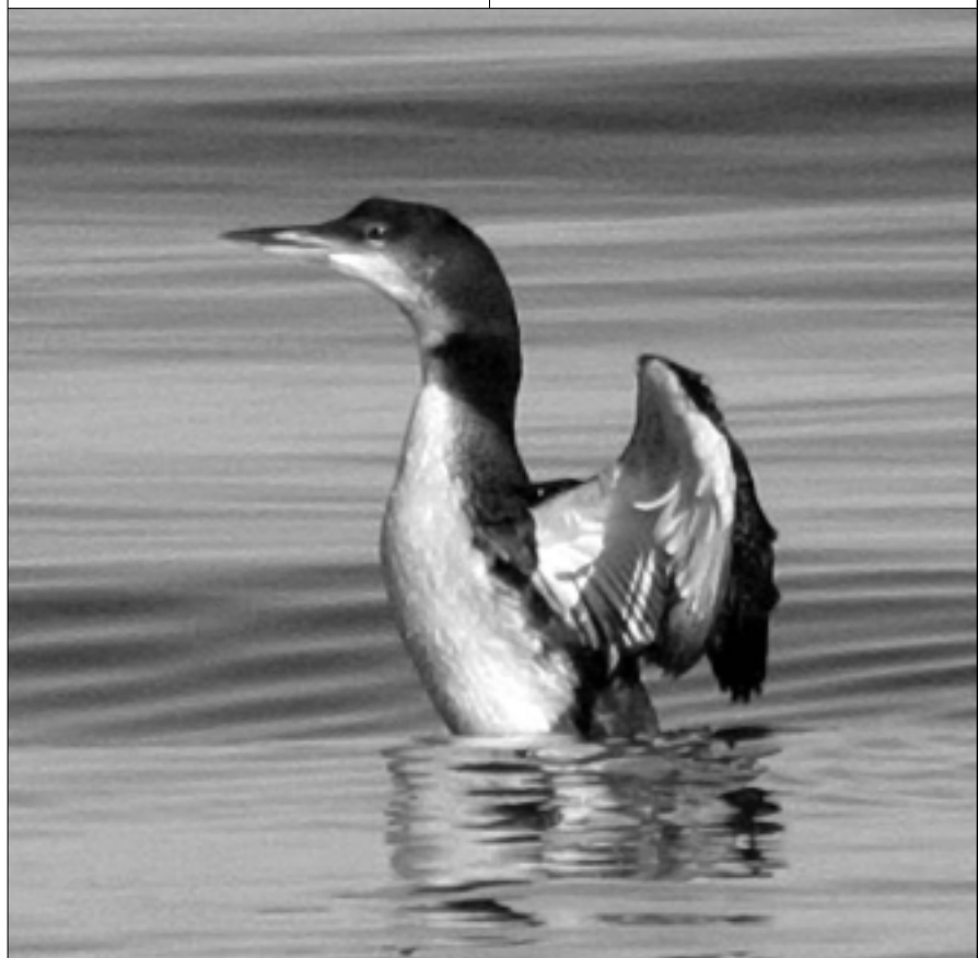
Common Loons ( Gavia immer ) can be found on Christmas Bird Counts in good numbers coastally across North America, and a new high count for Canada (618) was set this season at Comox, British Columbia.

(Wallaceburg, ON); Baltimore Oriole, 6 (Halifax-Dartmouth, ON); Gray-crowned Rosy-Finch, 2 (Vancouver, BC); Pine Grosbeak , 836 (Kenora, ON); Purple Finch, 425 (Louisbourg, NS); Cassin's Finch, 8 (Kelowna, BC); House Finch, 1805 (Kelowna, BC); Red Crossbill, 586 (Sooke, BC); White-winged Crossbill , 1293 (Algonquin Prov. Park, ON); Common Redpoll, 2286 (Ferryland, NL); Hoary Redpoll, 59 (Fort Simpson, NT); Pine Siskin, 2720 (Ferryland, NL); American Goldfinch, 1679 (Wolfville, NS); Evening Grosbeak , 846 (Gander, NL); House Sparrow , 5906 (Winnipeg, MB).