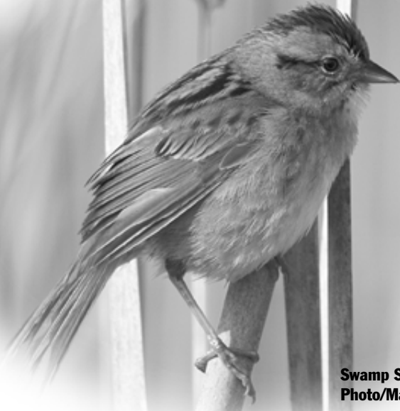
Swamp Sparrow