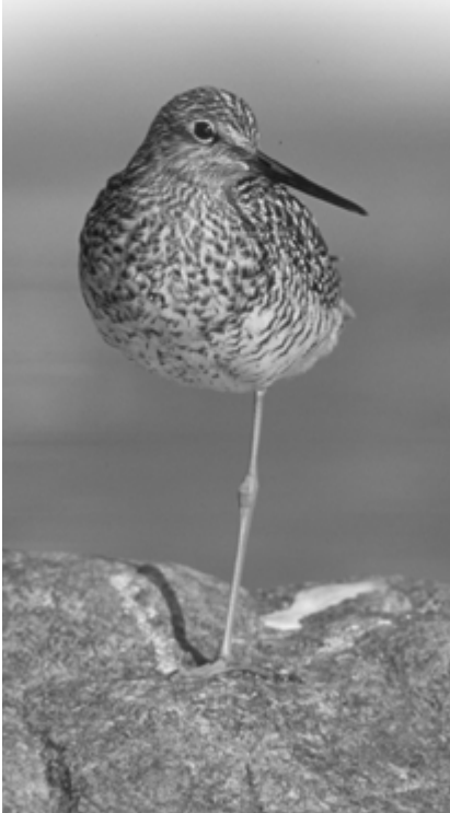
Lesser Yellowlegs

Virtually all species of boreal nesting birds also make use of parts of the Boreal Forest Region during migration. Some birds rely more on the Boreal Forest Region for migratory stopover habitat than for breeding or wintering. These 29 bird species (Table 5) include some that do not breed anywhere in the Boreal Forest Region. For