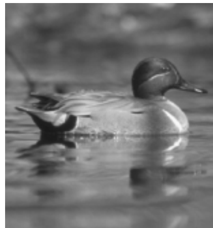
Green-winged Teal

Several of these species winter largely in a single country or region. American Black Ducks, Yellow Rails, Rusty Blackbirds, Smith's Longspurs, Harris's Sparrows, and Golden-crowned Sparrows are among species in which virtually the entire wintering population occurs only within the United States. Virtually all Cape May Warblers winter in the Caribbean. Most Baird's Sparrows winter in Mexico, while Yellow-bellied Flycatchers, Philadelphia Vireos, Wilson's Warblers, and Magnolia Warblers are restricted in winter to Mexico and Central America. Birds like the