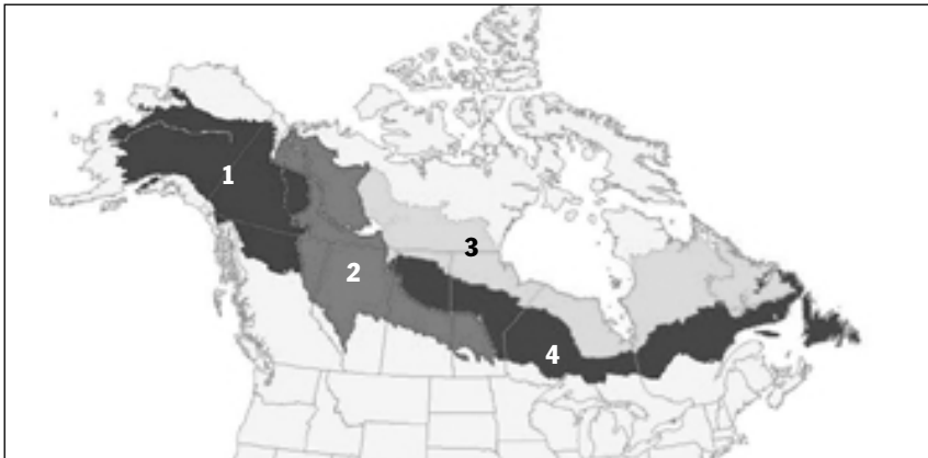
Figure 1. Bird Conservation Regions in North America's Boreal Forest Region 1 . 1: Northwestern Interior Forest (BCR 4), 2: Boreal Forest Region Taiga Plains (BCR 6), 3: Taiga Shield and Hudson Plains (BCR 7), 4: Boreal Forest Region Softwood Shield (BCR 8).